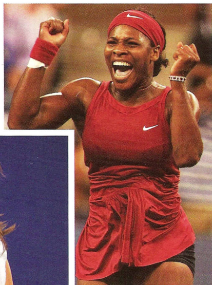
Serena and Venus go for bragging rights at the Garden in March.