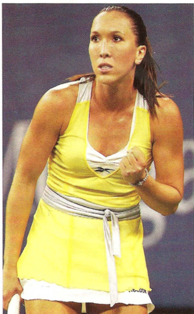
The pride of Serbia: Ana Ivanovic and Jelena Jankovic head for New York.

showdown part of their "Tennis Night in America" promotion to encourage young players to take up the sport.